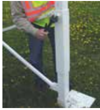
SILO LEG EXTENSIONS