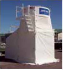
SINGLE BUMP OUT SILO ENCLOSURE