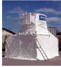
DOUBLE BUMP OUT SILO ENCLOSURE