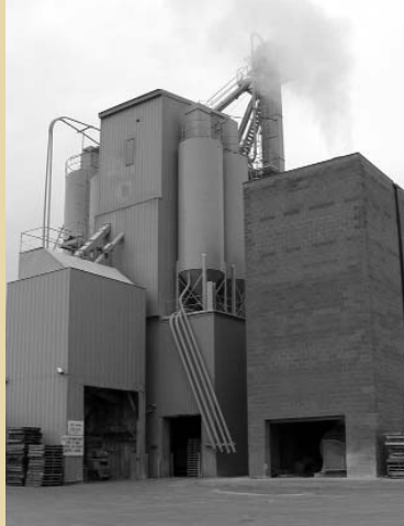
Twin City Concrete Product's St. Paul plant

Today, TCCP is able to offer a complete line of packaged concrete, stucco, shotcrete, grout, mortar and sand products to satisfy needs from the do-it-yourselfer to the professional mason contractor.