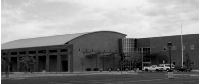
The Paseo Highlands Park Community Center, Phoenix, Ariz., was built with SPEC MIX IWR mortar in three colors: red, black and gray.

SPEC MIX IWR offers convenience and quality assurance for the masonry contractor. More importantly, it eliminates one more hand-add at the jobsite that can lead to mortar inconsistencies that effect the integrity of the