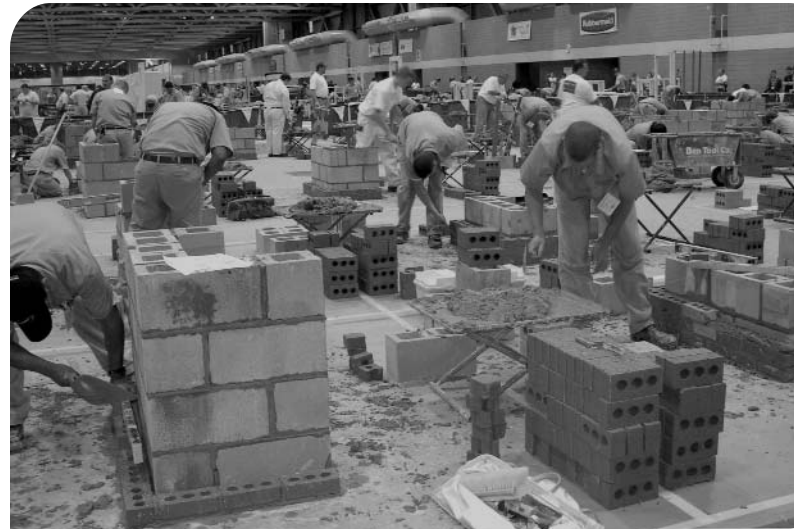
Forty-four masonry apprentices compete in the masonry competition of the SkillsUSA-VICA National Championships at Bartle Hall in Kansas City, Mo.

The masonry competition was one of 92 trade, technical and leadership competitions held June 23-27 at the SkillsUSA-VICA Championships. Approximately 4,350 vocational students from across the nation competed in these contests of skill.