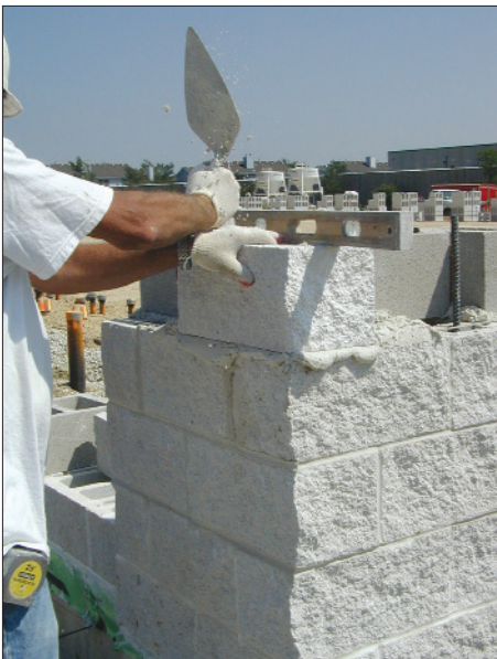
Formulated for superior bond