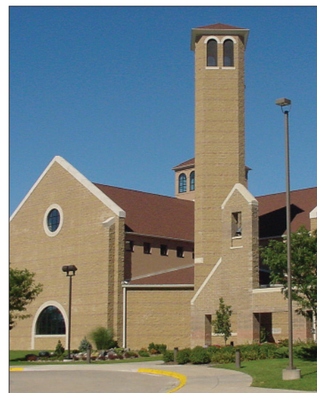
Preblended IWR mortar ensures consistency and quality for every job.