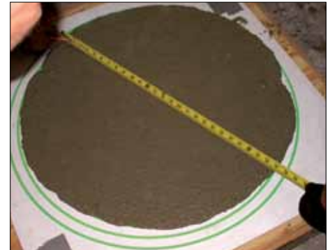
Total spread for SCG should range 22" - 30" (559 - 762 mm) when mixed with the appropriate water content.

Using clean, potable water, add either the