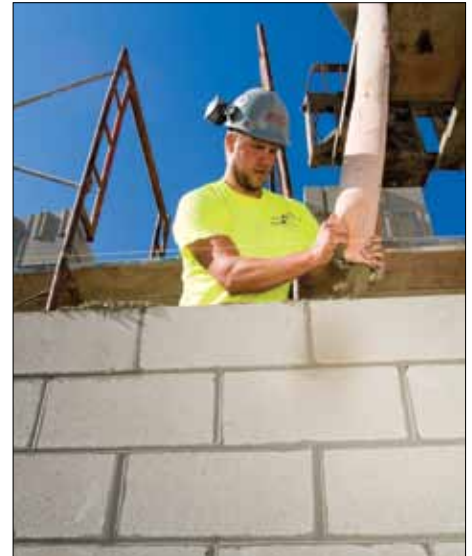
SPEC MIX SCG reduces labor by eliminating consolidation and reconsolidation of masonry grout.