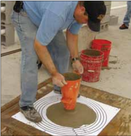
SCG Slump-Flow test targets a 20" (508 mm) spread in 2 - 5 seconds.