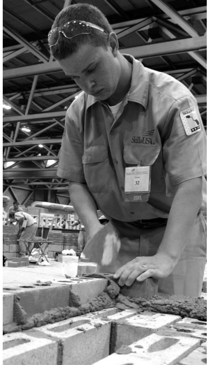
Photograph taken at the National Masonry Contest, held in Kansas City, in conjunction with the SkillsUSA National Leadership Conference in June of this year.