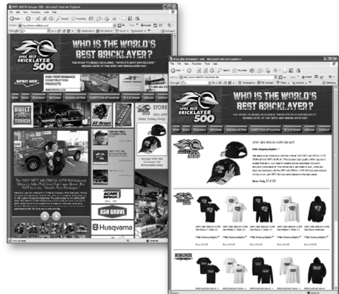
Photo Above: This is a sample of two of the web pages, the page in the background shows the SPEC MIX BRICKLAYER 500® web site home page. The image in the foreground is the store front page which features SPEC MIX BRICKLAYER 500 merchandise.

DSL broadband speed and Pentium 4 processor speed is required to view the web stream video. The DVD will also be available for purchase through the web store at www.specmixbricklayer500.com as well as ordering it through your SPEC MIX® licensee or call 1-888-SPECMIX.